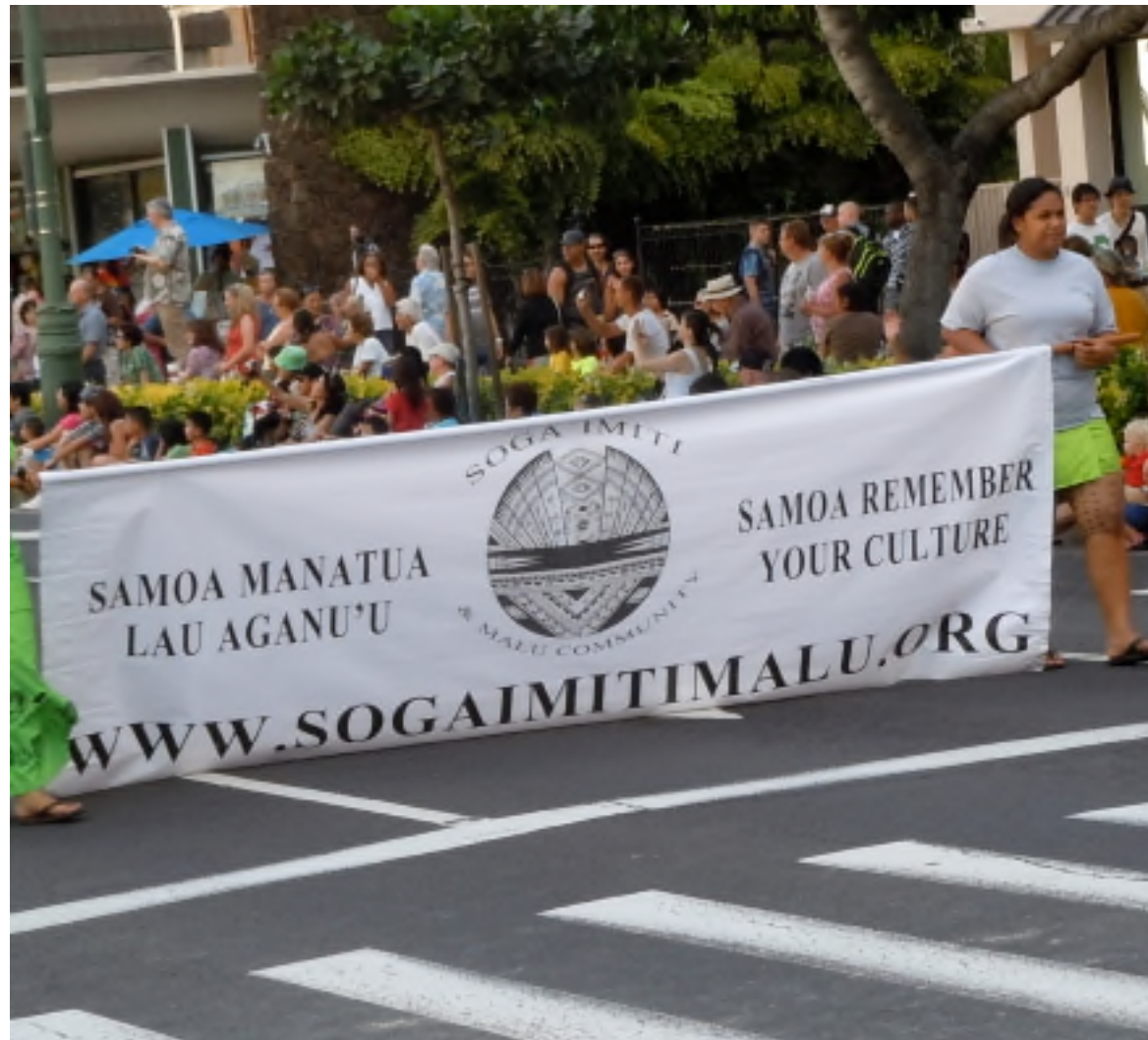
Figure 2.1 Remember "YOUR" Culture – Parade banner.